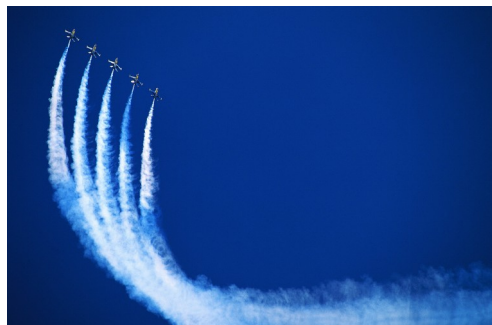
Because flying is more fun with friends!

The Chapter who increases their membership the most from Oct 1, 2011—April 30, 2012 wins. The prize is yet to be determined, but the current budget for prizes was increased to $100.00 during the meeting. As soon as the BOD determines the prize, they will be contacting all chapter chairs.