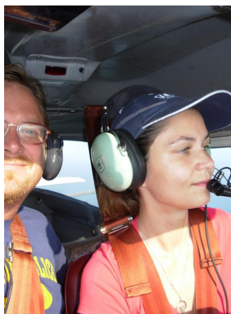
Here we are happily crammed together in the 150 .

It's taken me a while to feel comfortable with the responsibility of taking a non-pilot passenger, but on Sunday Nov. 20 I felt confident and more than ready. I took my husband up for our first flight together! He enjoyed himself and I was very happy to finally share my flying with him. It was a big day for us both!