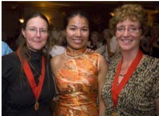
Team Wild Mama

Currently I am a small business owner and an aviation column writer for a Chinese aviation website to promote general aviation knowledge as well as female piloting. Through my own journey, I come to see that flying is the best way to discover who we truly are, to see our strengths and weaknesses, and to so see what life really mean. My dream is to help more women, especially Chinese ones, to get their wings.