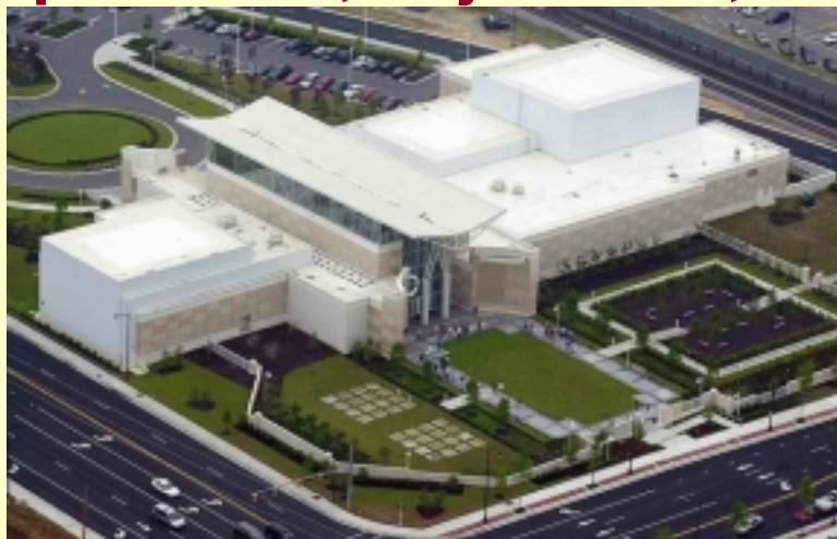
Airborne & Space Museum, Saturday night Dinner of the Southeast 99s.